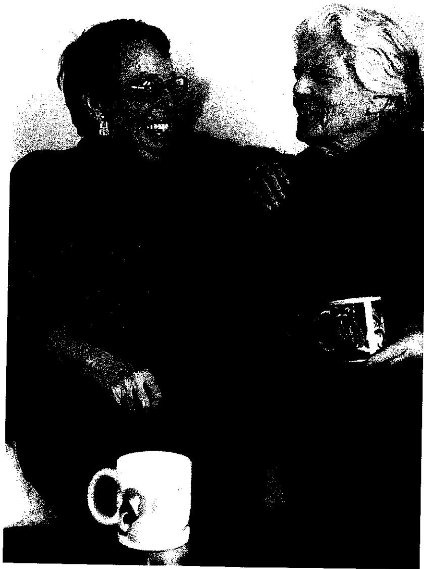
Phyllis Lyon and Del Martin