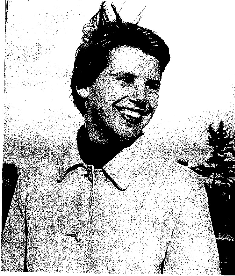
The Ladder , 1966. Only a few years later, The Ladder pioneered in using real gay individuals as cover subjects.