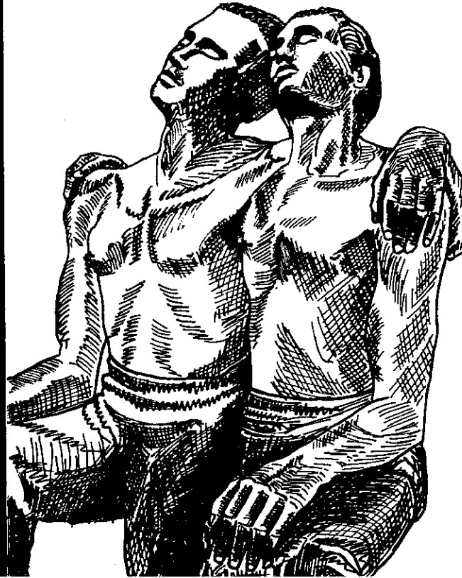
A cover of ONE Magazine , 1958.