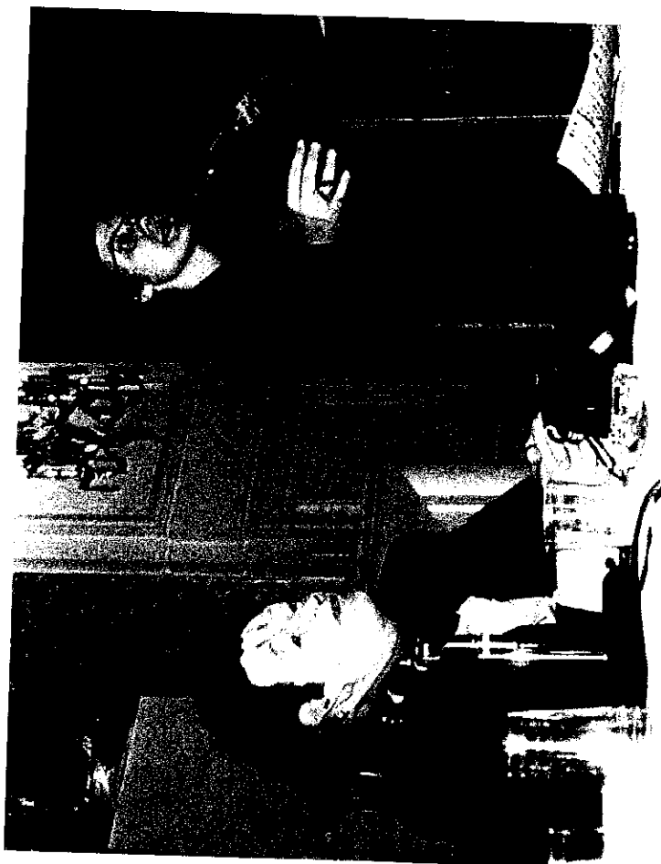
Dr. H. Anonymous listens while Barbara Gittings explains to the American Psychiatric Association audience why he must wear a mask and why all his gay peers remain in the closet. Dallas, 1972.