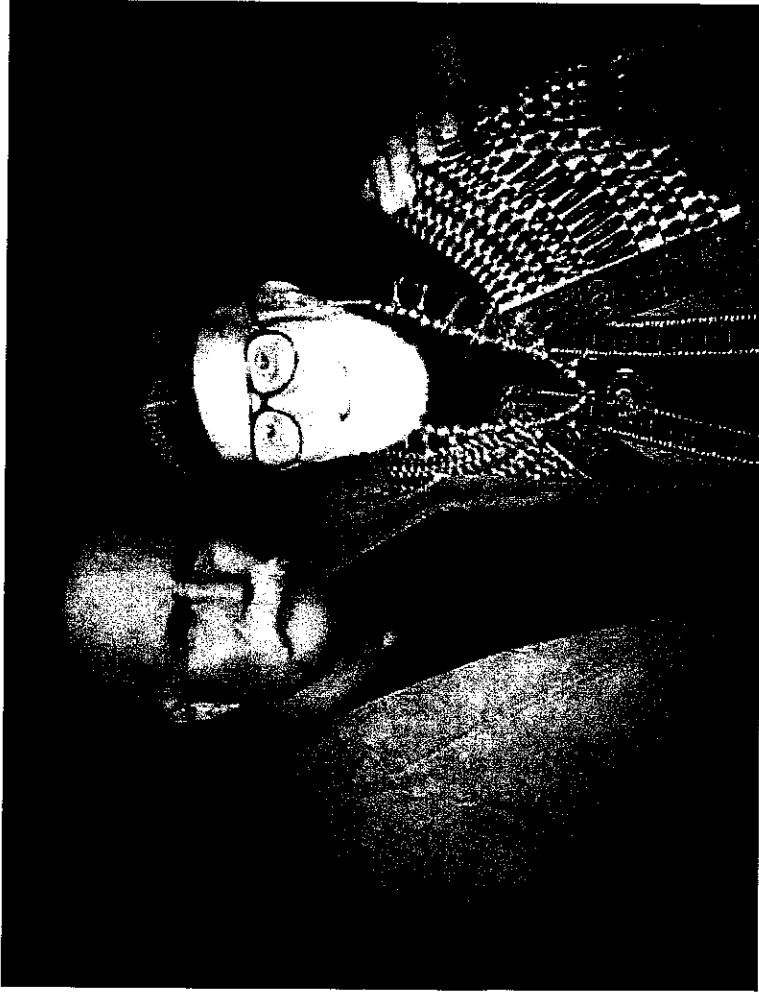
Jack Nicholson and Harry Hay, 1998.