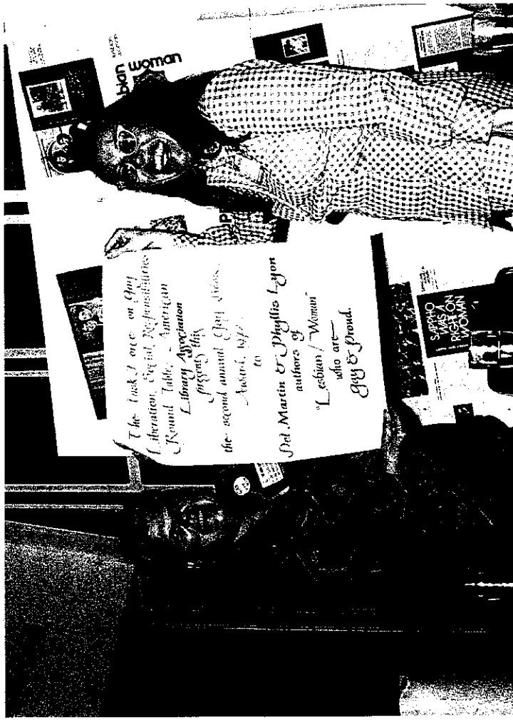
Del Martin (left) and Phyllis Lyon receiving the second annual Gay Book Award for their book Lesbian/Woman from the Task Force on Gay Liberation at the American Library Association annual conference, June 1972, Chicago.