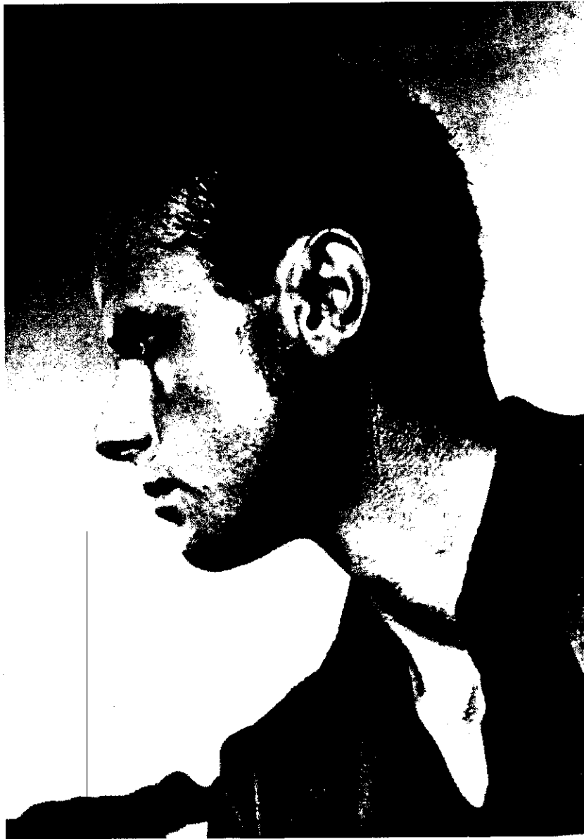
Harry Hay, c. 1934.