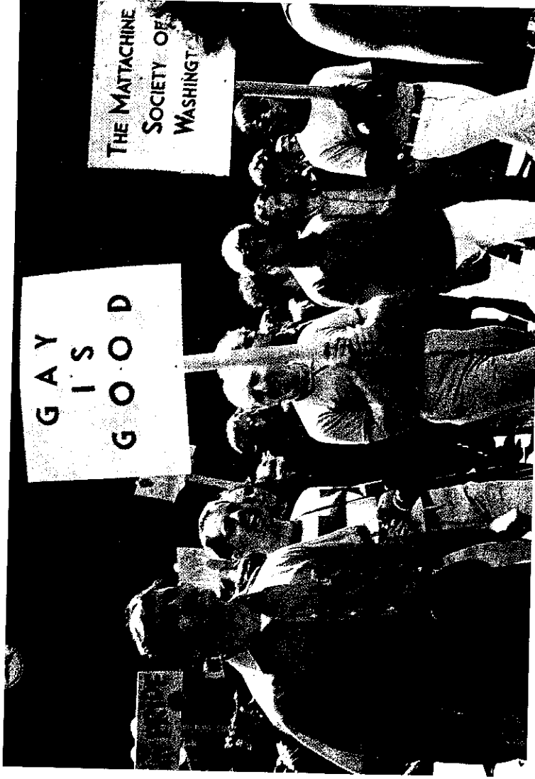
Frank Kameny carrying a sign with the slogan he coined, "Gay Is Good," in the first Gay Pride march, New York City, 1970.