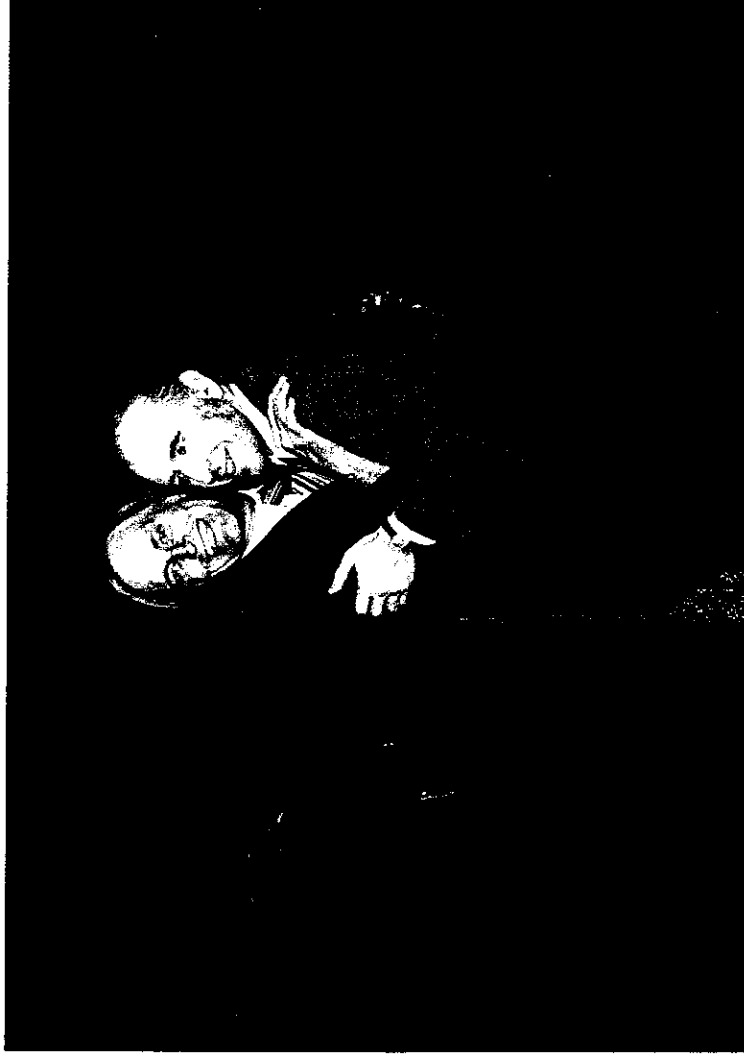
Frank Kameny (right) breaking the barrier with Philip Johnson at the psychiatrists' ball at the American Psychiatric Association conference, 1972.